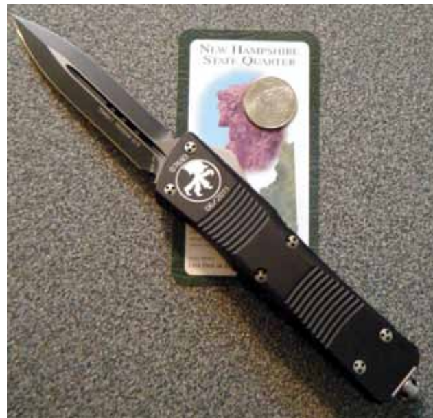
An out-the-front automatic, the Microtech Combat Troodon rests on a New Hampshire state quarter display.