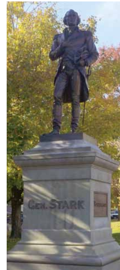
The monument honors Gen. John Stark who said the immortal words that are New Hampshire’s state motto, “Live Free or Die.”

from GoDaddy.com or a similar provider, and then get a free website from Weebly.com. This is exactly what we did. Our website was www.knifelawonline.com . The page headings on the website included the following, which anyone is free to copy: