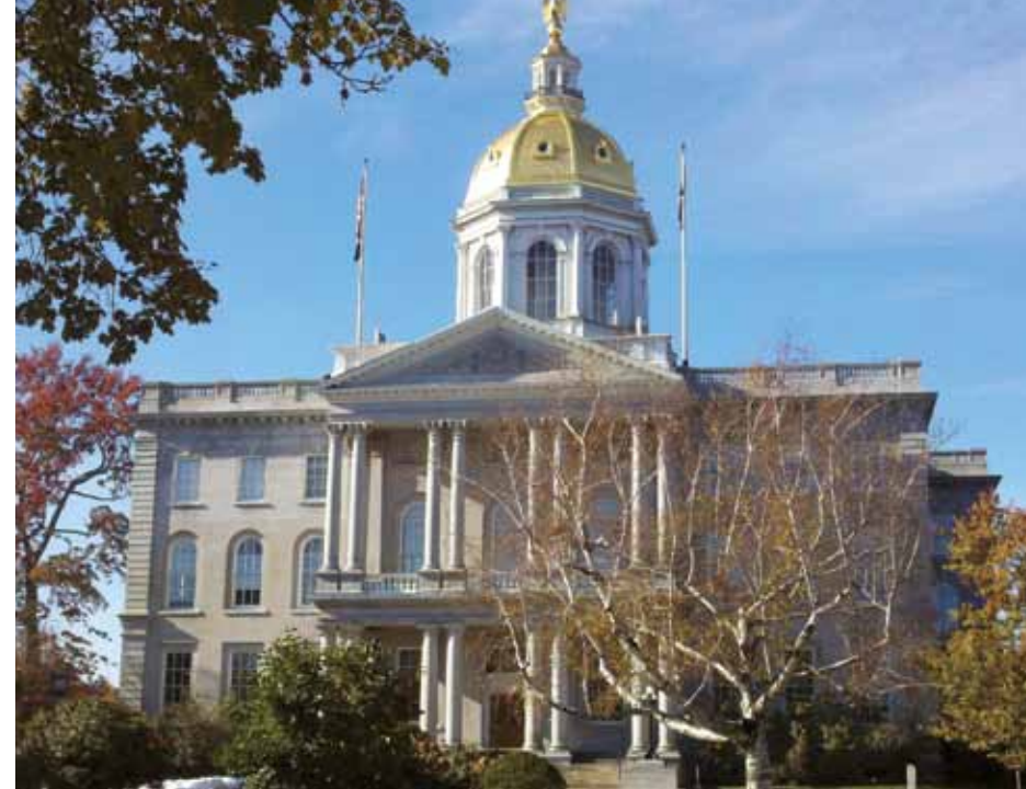
This is the beautiful New Hampshire Capitol where the knife rights bills passed.