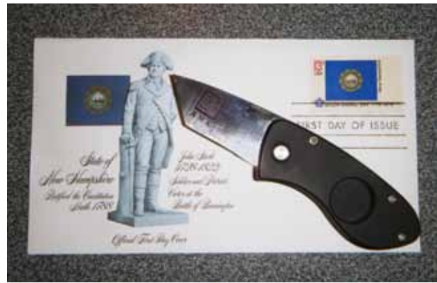
The author used his Al Mar Havana Clipper automatic knife/cigar cutter to cut the tip off a cigar he smoked in celebration of the passage of the New Hampshire knife rights bills. The knife is shown resting on a postal "First Day Cover" for the New Hampshire stamp.

The above may sound politically impossible. When do 425 people agree on anything, no less agree twice? However, the above is 100 percent true, and it shows that reforming archaic knife laws can be done anywhere, and party affiliation is irrelevant. Now is the window of opportunity for knife rights. There is